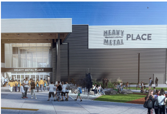
Heavy Metal Place