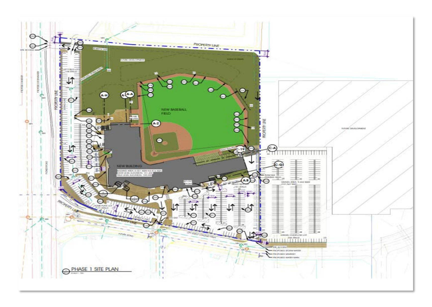
Ballpark Stadium site